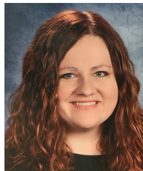
Lisa Wallen Wadsworth Middle School $400

To be used for updating their equipment for music program.