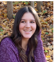
Wadsworth High School $500