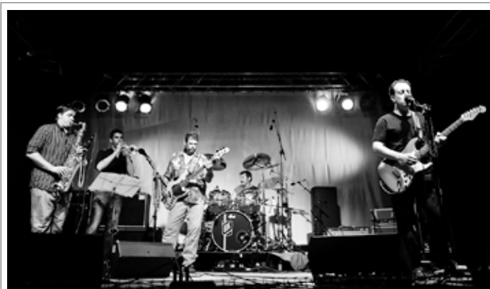
The Howlin' Cats played at Firestone Park on September 14

The month of October is annually recognized across the nation as National Arts and Humanities Month. The Medina County Arts Council and its members and member organizations join thousands of artists, arts organizations, businesses, and communities across America, in celebrating and planning delightful arts events, not only for this month, but for the year to come. To join in the celebration, check the events described in this newsletter, on our website, on the links to many arts organizations on our website, on our MedinaArtBuzz.blogspot.com , on local web calendars and in local newspapers, and then check with your local library for a list of arts related activities. Please join the Arts Council in honoring the efforts of artists, historians, teachers, and all the cultural groups working to make the arts and humanities a part of everyone's life here in Medina County. Everyone benefits from the creative and cultural value of the arts and humanities.